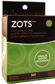
Zots MEDIUM Clear Adhesive Dots...