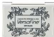
Tsukineko VersaFine ONYX BLACK Ink...