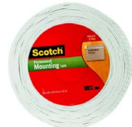
3M Scotch DOUBLE-SIDED FOAM TAPE...