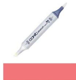
Copic Sketch Marker R24 PRAWN Red