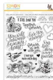
Simon Says Clear Stamps LOVE ALWAYS...