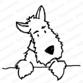
Impression Obsession Cling Stamp...