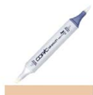
Copic Sketch Marker E35 CHAMOIS Light...