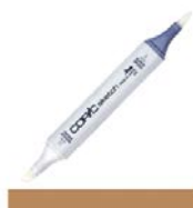
Copic Sketch Marker E57 LIGHT WALNUT...