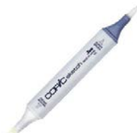
Copic Sketch Marker R29 LIPSTICK RED...