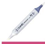
Copic Sketch Marker R39 GARNET Dark Red