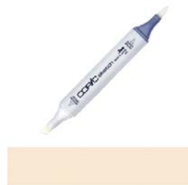
Copic Sketch Marker E31 BRICK BEIGE...