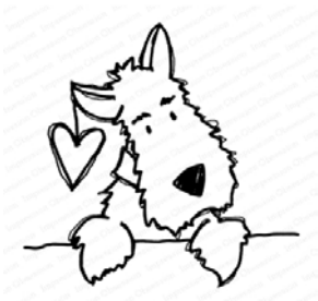
Impression Obsession Cling Stamp...

Here are the supplies used in today's Darby Love Valentine Cards. Where available I use Compensated Affiliate Links, which means if you make a purchase through my link, I receive a small commission at no extra cost to you. Thank you so very much for your support, it helps to keep my blog and YouTube channel running and I truly appreciate it.