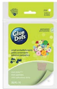
252 GREEN 33709 MINI GLUE DOTS 21...