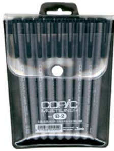
Copic Multiliner B-2 SET Black Ink...