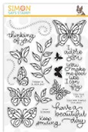
Simon Says Clear Stamps BEAUTIFUL DAY...

Here are the supplies used in today's Beautiful Day Card. Where available I use Compensated Affiliate Links, which means if you make a purchase through my link, I receive a small commission at no extra cost to you. Thank you so very much for your support, it helps to keep my blog and YouTube channel running and I truly appreciate it.