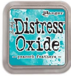
Tim Holtz Distress Oxide Ink Pad...