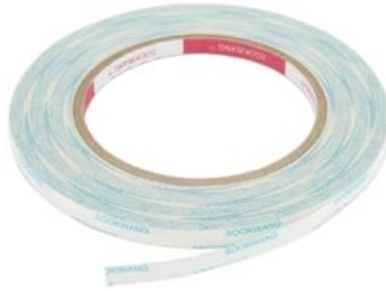
Scor-Tape 1/4 Inch Crafting Tape