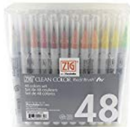
Zig Clean Color Real Brush Markers...