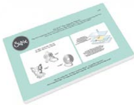
Sizzix MAGNETIC PLATFORM Big Shot...