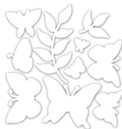
Simon Says Stamp BEAUTIFUL DAY Wafer...