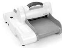
Sizzix BIG SHOT EXPRESS Gray and...