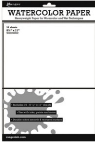
Ranger WATERCOLOR PAPER Inkssentials...