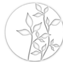
Simon Says Stamp CIRCLE LEAVES Wafer...