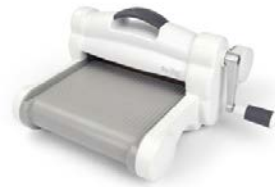
Sizzix BIG SHOT PLUS MACHINE Gray And...