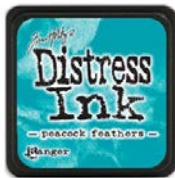
Tim Holtz Distress Mini Ink Pad...