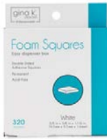
Therm O Web Gina K Designs WHITE FOAM...