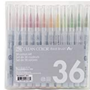
Zig Clean Color Real Brush Markers...