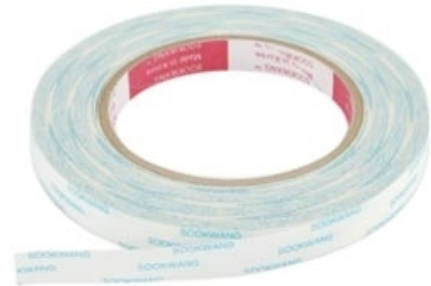
Scor-Tape 1/2 Inch Crafting Tape