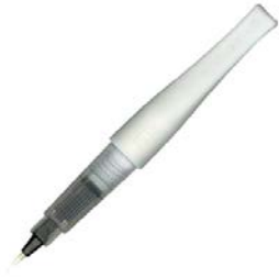
ZIG Wink of Stella GLITTER CLEAR...