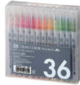
Zig CLEAN COLOR 36 SET Real Brush...