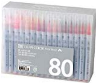
Kuretake Zig Clean Color Real Brush...