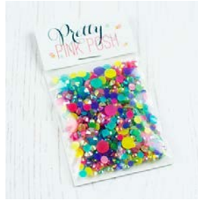
Pretty Pink Posh PARTY Jewels Mix