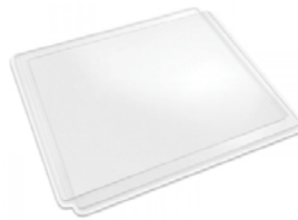
Sizzix Big Shot Pro STANDARD Cutting...