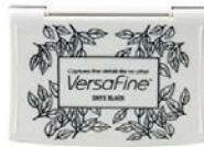
Tsukineko VersaFine ONYX BLACK Ink...