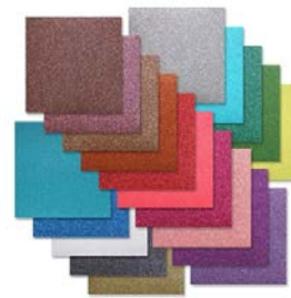
Simon Says Stamp Cardstock ASSORTMENT...