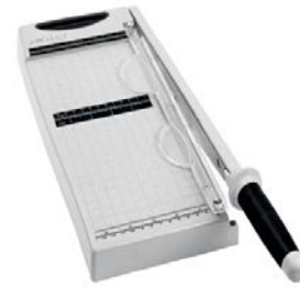
Tim Holtz Tonic MAXI GUILLOTINE...