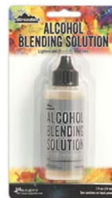
Tim Holtz Ranger ALCOHOL BLENDING...