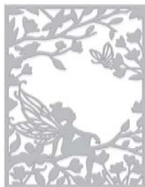
Hero Arts Fancy Die FAIRY WINDOW DI585

Here are the supplies used in today's Hero Arts Fairy Window Alcohol Ink Card. Where available I use Compensated Affiliate Links, which means if you make a purchase through my link, I receive a small commission at no extra cost to you. Thank you so very much for your support, it helps to keep my blog and YouTube channel running and I truly appreciate it.