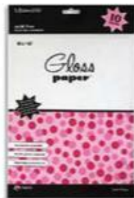
Ranger Glossy Cardstock, White, 10 pk