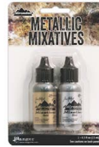
Tim Holtz Alcohol Ink Set GOLD SILVER...