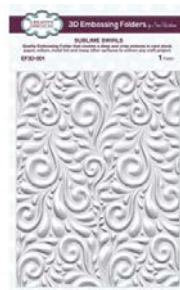
Creative Expressions SUBLIME SWIRLS...