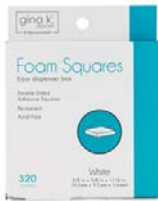
Therm O Web Gina K Designs WHITE FOAM...