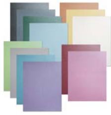
Simon Says Stamp Cardstock GLIMMERY...