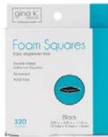
Therm O Web Gina K Designs BLACK FOAM...