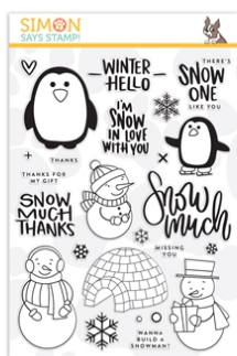
Simon Says Clear Stamps SNOW MUCH...

Here are the supplies used in today's Simon Says Snow Much Card. Where available I use Compensated Affiliate Links, which means if you make a purchase through my link, I receive a small commission at no extra cost to you. Thank you so very much for your support, I truly appreciate it.