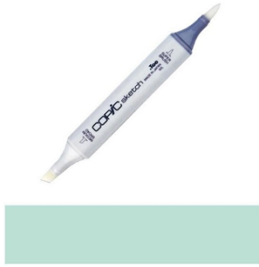
Copic Sketch Marker BG32 AQUA MINT