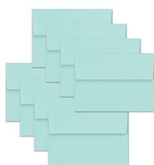
Simon Says Stamp Envelopes AUDREY...