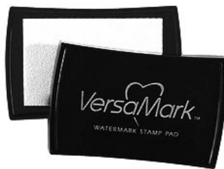
Tsukineko Versamark EMOSS INK PAD...