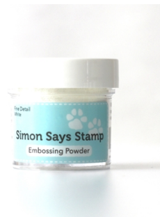
Simon Says Stamp EMBOSSING POWDER...