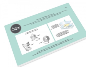
Sizzix MAGNETIC PLATFORM Big Shot...