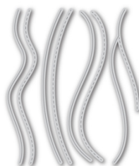
Simon Says Stamp STITCHED SLOPES AND...