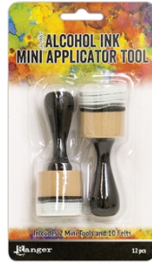
Tim Holtz Alcohol Ink MINI APPLICATOR...