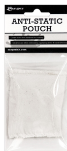
Ranger ANTI STATIC POUCH ink62332