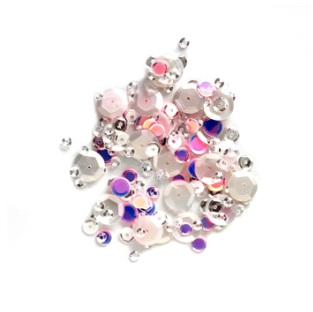
Simon Says Stamp Sequins GIRL'S BEST...