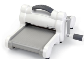
Sizzix BIG SHOT MACHINE Gray And...