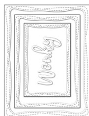
Simon Says Stamp WONKY RECTANGLES...