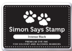
Simon Says Stamp Premium Ink Pad...