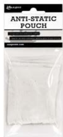
Ranger ANTI STATIC POUCH ink62332