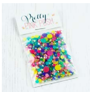
Pretty Pink Posh PARTY Jewels Mix