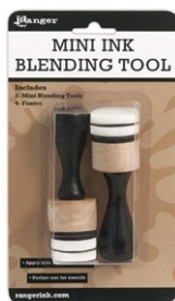
Ranger MINI ROUND INK BLENDING TOOLS...