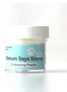
Simon Says Stamp EMBOSSING