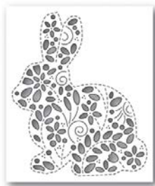
Simon Says Stamp FILIGREE BUNNY Wafer...

Here are the supplies used in today’s Simon Says Stamp Filigree Bunny Card. Where available I use Compensated Affiliate Links, which means if you make a purchase through my link, I receive a small commission at no extra cost to you. Thank you so very much for your support, I truly appreciate it.