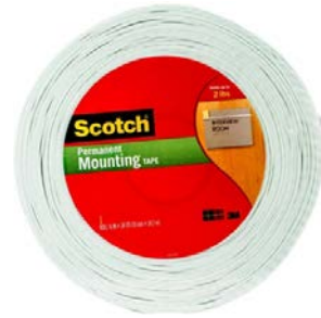
3M Scotch DOUBLE-SIDED FOAM TAPE...