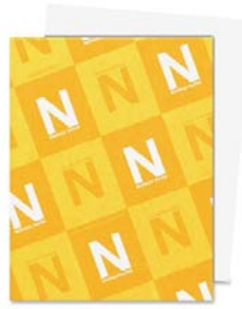
Neenah Classic Crest 80 LB REAM...