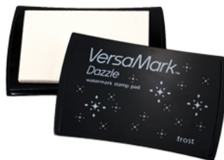
Tsukineko VersaMark FROST DAZZLE...