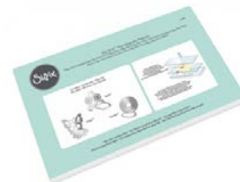
Sizzix MAGNETIC PLATFORM Big Shot...