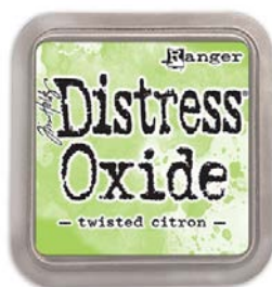
Tim Holtz Distress Oxide Ink Pad...