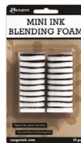
Ranger MINI ROUND FOAM REFILLS IBT40972