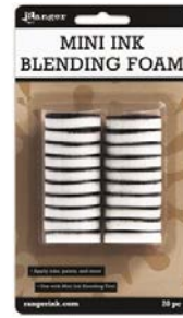
Ranger MINI ROUND FOAM REFILLS IBT40972