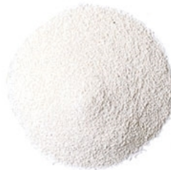
Hero Arts EMBOSS ULTRA FINE CLEAR...