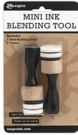
Ranger MINI ROUND INK BLENDING TOOLS...