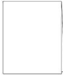
Hero Hues Dove white Top Folded Cards