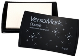
Tsukineko VersaMark FROST DAZZLE...