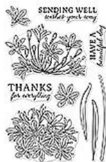
Beautiful Day Agapanthus

Here are the supplies used in today’s Hero Arts Beautiful Day Agapanthus Card. Where available I use Compensated Affiliate Links, which means if you make a purchase through my link, I receive a small commission at no extra cost to you. Thank you so very much for your support, I truly appreciate it.