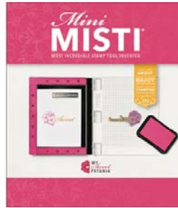
MINI MISTI PRECISION STAMPER Stamping...