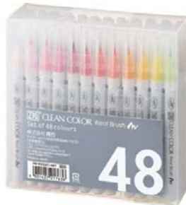
Zig CLEAN COLOR 48 SET Real Brush...