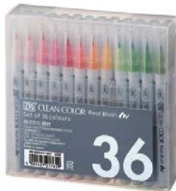
Zig CLEAN COLOR 36 SET Real Brush...