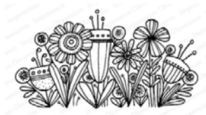
Impression Obsession Cling Stamp...

Here are the supplies used in today's Hero Arts Beautiful Day Agapanthus Card. Where available I use Compensated Affiliate Links, which means if you make a purchase through my link, I receive a small commission at no extra cost to you. Thank you so very much for your support, I truly appreciate it.