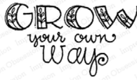
Impression Obsession Cling Stamp GROW...