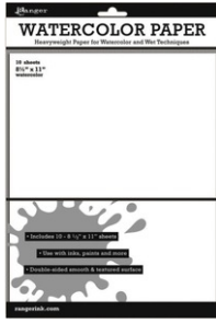
Ranger WATERCOLOR PAPER Inkssentials...