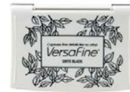
Tsukineko VersaFine ONYX BLACK Ink...