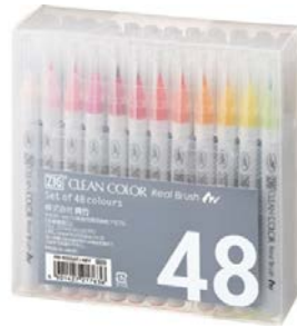
Zig CLEAN COLOR 48 SET Real Brush...