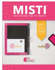
MISTI PRECISION STAMPER Stamping Tool...