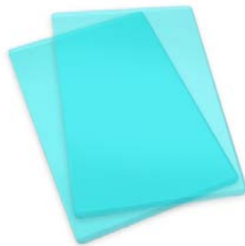
Sizzix MINT Standard Cutting Pads...