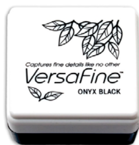
Tsukineko VersaFine SMALL ONYX BLACK...