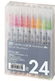
Zig CLEAN COLOR 24 SET Real Brush...