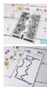
Mama Elephant Clear Stamp and Die...