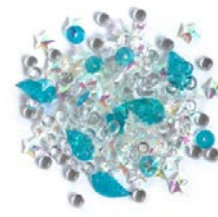
Buttons Galore and More Sparkletz...