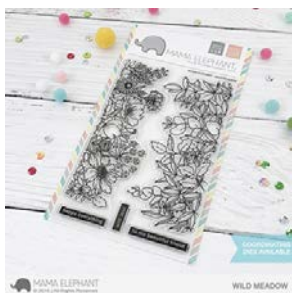
Mama Elephant Clear Stamps WILD MEADOW

Here are the supplies used in today's Mama Elephant – Wild Meadow Card. Where available I use Compensated Affiliate Links, which means if you make a purchase through my link, I receive a small commission at no extra cost to you. Thank you so very much for your support, I truly appreciate it.