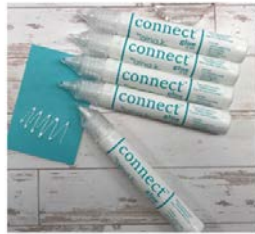
Gina K Designs CONNECT GLUE Adhesive...