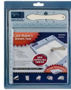
Scor-Pal MINI SCOR-BUDDY Scoring...