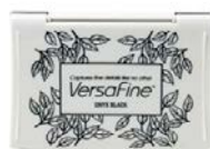
Tsukineko VersaFine ONYX BLACK Ink...