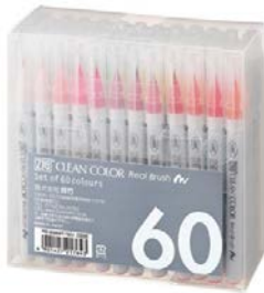
Zig CLEAN COLOR 60 SET Real Brush...