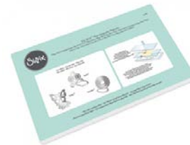
Sizzix MAGNETIC PLATFORM Big Shot...