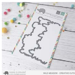
Mama Elephant WILD MEADOW Creative...