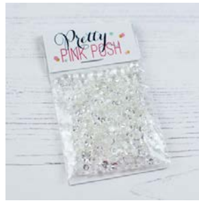
Pretty Pink Posh SPARKLING CLEAR Jewels