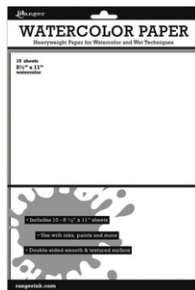
Ranger WATERCOLOR PAPER Inkssentials...