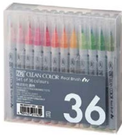
Zig CLEAN COLOR 36 SET Real Brush...