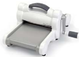
Sizzix BIG SHOT MACHINE Gray And...