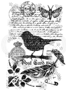
Woodware Clear Stamp Set Bird on a...

Here are the supplies used in today’s Nuvo Shimmer Powder and Woodware Bird on the Branch Card. Where available I use Compensated Affiliate Links, which means if you make a purchase through my link, I receive a small commission at no extra cost to you. Thank you so very much for your support, I truly appreciate it.