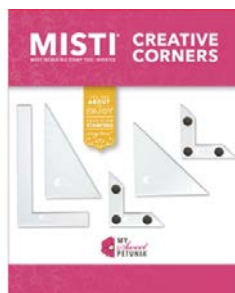
MISTI CREATIVE CORNERS Positioning...