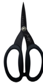
Tim Holtz Tonic Craft SCISSORS Micro...