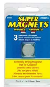
MISTI SUPER MAGNETS Disc mistism