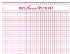
MISTI MOUSE PAD INSERT 000144