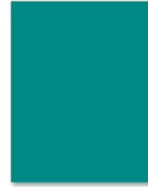
Simon Says Stamp Card Stock 100#...