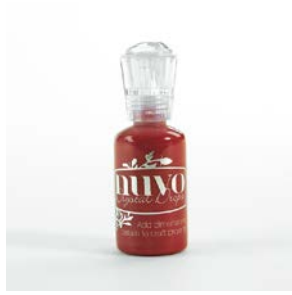
Nuvo by Tonic Studios Crystal Drops -...