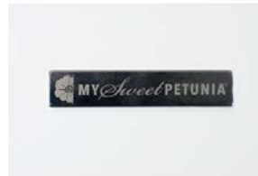
MISTI Neodymium BAR MAGNET 007070