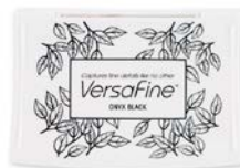
Tsukineko Versafine Ink Pad - Onyx Black