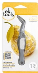
EK Success CRAFT TWEEZERS Precision...