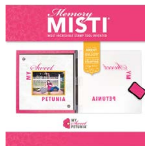
MISTI MEMORY MISTI PRECISION STAMPER...