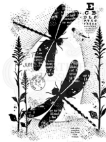
Woodware Clear Stamp Set Dancing...