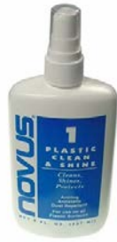
Novus PLASTIC CLEAN AND SHINE 1 MISTI...