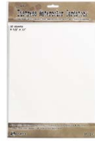
Tim Holtz 8.5 X 11 DISTRESS...