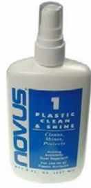
Novus PLASTIC CLEAN AND SHINE 1 MISTI...