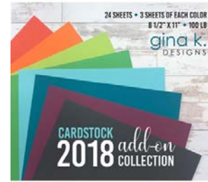
Gina K Designs 2018 ADD-ON COLLECTION...