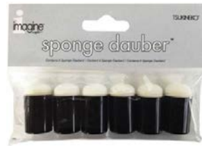
Tsukineko 6 SPONGE DAUBERS Tools...