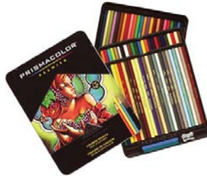
Prismacolor PREMIER COLORED PENCILS...