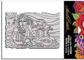
Stampendous Cling Stamp MERMAID FLOW...