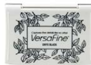
Tsukineko VersaFine ONYX BLACK Ink...