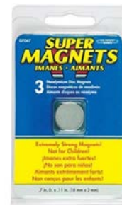
MISTI SUPER MAGNETS Disc mistism