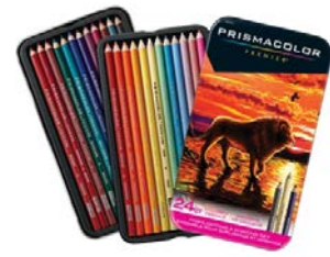
Prismacolor HIGHLIGHTING & SHADING...