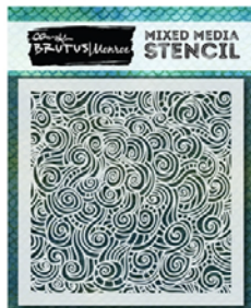
Brutus Monroe MERMAID LAGOON TANGLED...