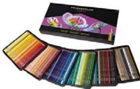
Prismacolor 150 PREMIER COLORED...