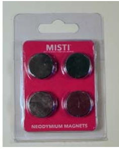
MISTI NEODYMIUM MAGNETS 4 Pack Discs...