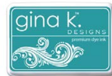
Gina K Designs TURQUOISE SEA PREMIUM...