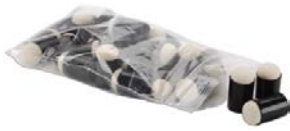
Tsukineko 25 SPONGE DAUBERS Tools...