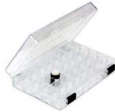
Tsukineko STORAGE BOX Sponge Daubers...