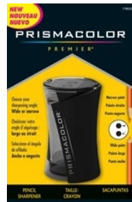
Prismacolor PENCIL SHARPENER Pencils...