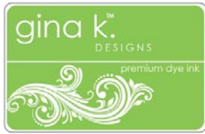
Gina K Designs LUCKY CLOVER Premium...