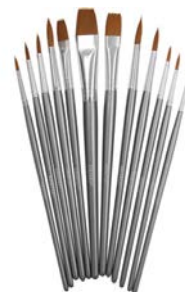
Tonic PAINT BRUSHES Nuvo 972n