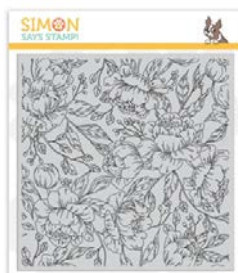
Simon Says Cling Rubber Stamp PRETTY...

Here are the supplies used in today's Pretty Peonies Background Card. Where available I use Compensated Affiliate Links, which means if you make a purchase through my link, I receive a small commission at no extra cost to you. Thank you so very much for your support, it helps to keep my blog and YouTube channel running and I truly appreciate it.