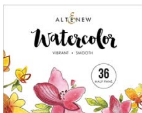
Altenew WATERCOLOR 36 PAN SET ALT1966