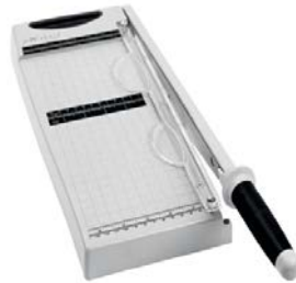
Tim Holtz Tonic MAXI GUILLOTINE...