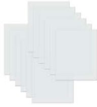
Simon Says Stamp VELLUM SSSVEL12