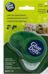
Glue Dots REMOVABLE GLUE SQUARES...