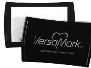
Tsukineko Versamark EMBOSS INK PAD...