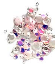
Simon Says Stamp Sequins GIRL'S BEST...