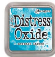
Tim Holtz Distress Oxide