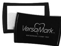
Tsukineko VersaMark EMBOSS INK