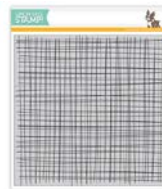
Simon Says Cling Rubber Stamp SKETCHY...

Here are the supplies used in today's Bouquet of Roses and Sketchy Lines Congrats cards. Where available I use Compensated Affiliate Links, which means if you make a purchase through my link, I receive a small commission at no extra cost to you. Thank you so very much for your support, I truly appreciate it.