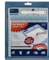
Scor-Pal MINI SCOR- BUDDY Scoring...