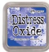
Tim Holtz Distress Oxide