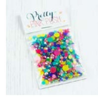
Pretty Pink Posh PARTY Jewels Mix