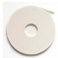
Simon Says Stamp BIG MOMMA FOAM TAPE...