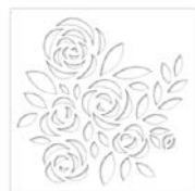
Simon Says Stamp Stencil BOUQUET OF...

Here are the supplies used in today's Bouquet of Roses and Sketchy Lines Congrats cards. Where available I use Compensated Affiliate Links, which means if you make a purchase through my link, I receive a small commission at no extra cost to you. Thank you so very much for your support, I truly appreciate it.