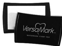
Tsukineko Versamark EMBOSS INK