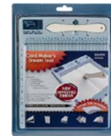
Scor-Pal MINI SCOR- BUDDY Scoring...