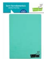
Lawn Fawn STAMP SHAMMY Cleaner LF1045