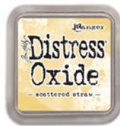
Tim Holtz Distress Oxide Ink Pad...