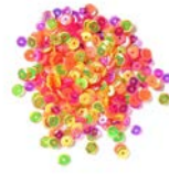
Simon Says Stamp Sequins CARIBBEAN...