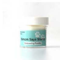
Simon Says Stamp EMBOSSING POWDER...