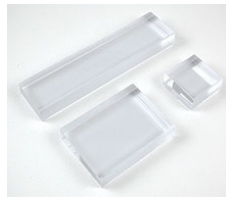
Hero Arts Rubber Stamp SMALL BLOCK...