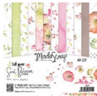
ModaScrap LET YOUR SOUL BLOOM 6x6...

Here are the supplies used in today's card. Where available I use Compensated Affiliate Links, which means if you make a purchase through my link, I receive a small commission at no extra cost to you. Thank you so very much for your support, I truly appreciate it.