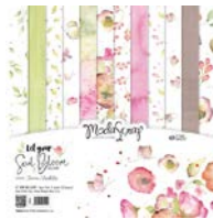
ModaScrap LET YOUR SOUL BLOOM 12x12...