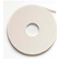
Simon Says Stamp BIG MOMMA FOAM TAPE...