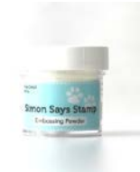
Simon Says Stamp EMBOSSING POWDER...