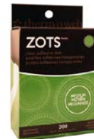
Zots MEDIUM Clear Adhesive Dots...