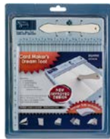
Scor-Pal MINI SCOR- BUDDY Scoring...