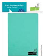
Lawn Fawn STAMP SHAMMY Cleaner LF1045