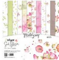
ModaScrap LET YOUR SOUL BLOOM 12x12...