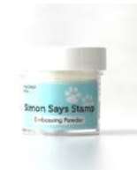
Simon Says Stamp EMBOSING POWDER...