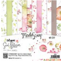
ModaScrap LET YOUR SOUL BLOOM 6x6...

Here are the supplies used in today's card. Where available I use Compensated Affiliate Links, which means if you make a purchase through my link, I receive a small commission at no extra cost to you. Thank you so very much for your support, I truly appreciate it.