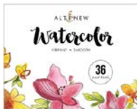
Altenew WATERCOLOR 36 PAN SET ALT1966