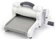
Sizzix BIG SHOT MACHINE Gray And...