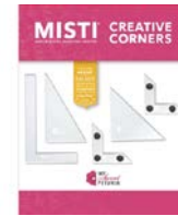
MISTI CREATIVE CORNERS Positioning...