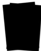
Creative Expressions Foundation Card...