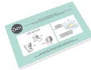
Sizzix MAGNETIC PLATFORM Big Shot...