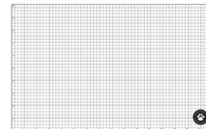
Simon Says Stamp LARGE GRID PAPER...