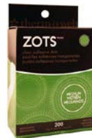
Zots MEDIUM Clear Adhesive Dots...