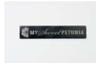
MISTI Neodymium BAR MAGNET 007070