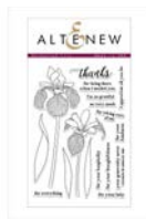
Altenew - Enchanted Iris Stamp Set

Here are the supplies used in today's Altenew Enchanted Iris – Easy Watercolor Techniques card. Where available I use Compensated Affiliate Links, which means if you make a purchase through my link, I receive a small commission at no extra cost to you. Thank you so very much for your support, I truly appreciate it.