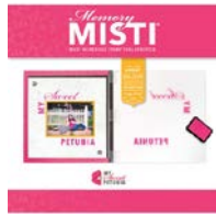
MISTI MEMORY MISTI PRECISION STAMPER...