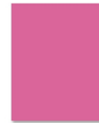
Simon Says Stamp Card Stock 100# DOLL...