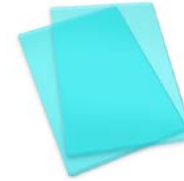
Sizzix MINT Standard Cutting Pads...