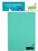
Lawn Fawn STAMP SHAMMY Cleaner LF1045