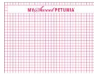
MISTI MOUSE PAD INSERT 000144