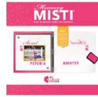
MISTI MEMORY MISTI PRECISION STAMPER...