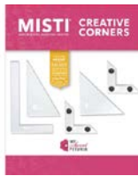
MISTI CREATIVE CORNERS Positioning...