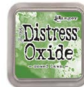
Tim Holtz Distress Oxide Ink Pad...