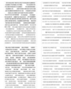
Simon Says Stamp SENTIMENT STRIPS 2...