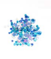
Simon Says Stamp Sequins RAINDROPS...