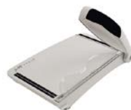
Tim Holtz Tonic GUILLOTINE COMFORT...