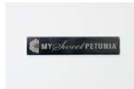
MISTI Neodymium BAR MAGNET 007070