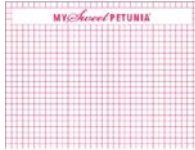
MISTI MOUSE PAD INSERT 000144