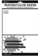
Ranger WATERCOLOR PAPER Inkssentials...