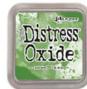
Tim Holtz Distress Oxide Ink Pad...