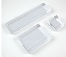
Hero Arts Rubber Stamp SMALL BLOCK...