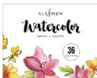
Altenew WATERCOLOR 36 PAN SET ALT1966