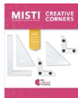
MISTI CREATIVE CORNERS Positioning...