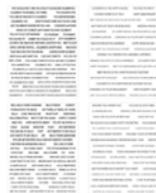
Simon Says Stamp SENTIMENT STRIPS 2...