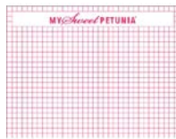
MISTI MOUSE PAD INSERT 000144