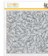
Simon Says Cling Rubber Stamp PRETTY...