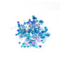
Simon Says Stamp Sequins RAINDROPS...