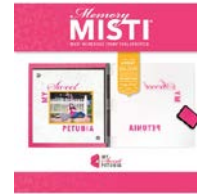
MISTI MEMORY MISTI PRECISION STAMPER...