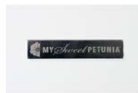
MISTI Neodymium BAR MAGNET 007070