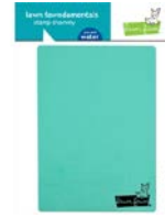
Lawn Fawn STAMP SHAMMY Cleaner LF1045