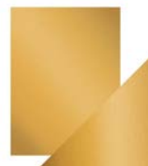
Craft Perfect - Mirror Card Satin - ...