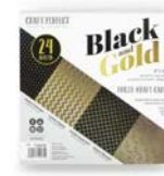
Craft Perfect - 6x6 Card Packs -...