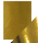
Craft Perfect - Mirror Card Gloss -...