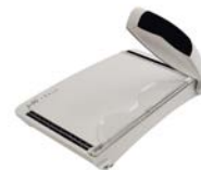
Tim Holtz - 8.5" / 22cm Trimmer - 160e