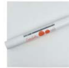
Tonic Studios - Surfaces - Easy Clean...