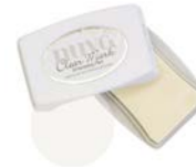
Nuvo - Clear Mark Embossing Pad - 101n