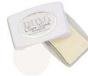
Nuvo - Clear Mark Embossing Pad - 101n