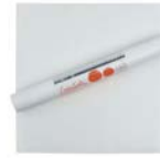
Tonic Studios - Surfaces - Easy Clean...