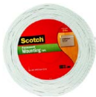
3M Scotch DOUBLE- SIDED FOAM TAPE...