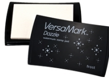
Tsukineko VersaMark FROST DAZZLE...