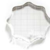
Simon Says Stamp 2.5 Inch ACRYLIC...