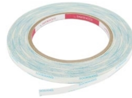
Scor-Tape 0.25 Inch Crafting Tape