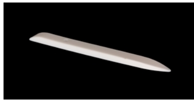
Simon Says Stamp SMALL TEFLON BONE...