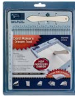
Scor-Pal MINI SCOR-BUDDY Scoring...