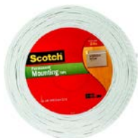
3M Scotch DOUBLE- SIDED FOAM TAPE...