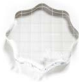
Simon Says Stamp 3.5 Inch ACRYLIC...