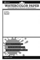
Ranger WATERCOLOR PAPER Inkssentials...