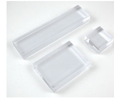
Hero Arts Rubber Stamp SMALL BLOCK...