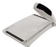
Tim Holtz Tonic GUILLOTINE COMFORT...