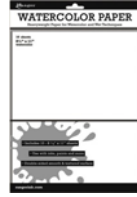
Ranger WATERCOLOR PAPER Inkssentials...