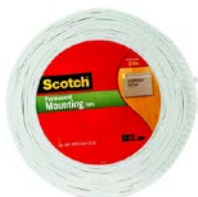
3M Scotch DOUBLE- SIDED FOAM TAPE...