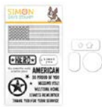
Simon Says Stamps and Dies PATRIOTIC...

Here are the supplies used. Where available I use Compensated Affiliate Links , which means if you make a purchase through my link, I receive a small commission at no extra cost to you. Thank you so very much for your support, I truly appreciate it.