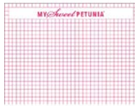
MISTI MOUSE PAD INSERT 000144