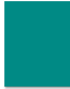
Simon Says Stamp Card Stock 100#...