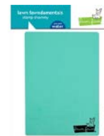
Lawn Fawn STAMP SHAMMY Cleaner LF1045