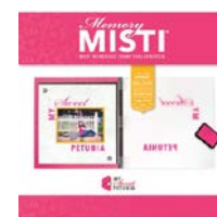
MISTI MEMORY MISTI PRECISION STAMPER...