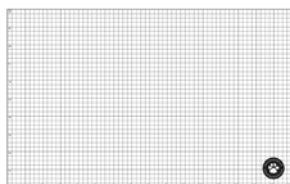
Simon Says Stamp LARGE GRID PAPER...