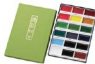
Zig Kuretake Gansai Tambi 18 COLOR SET