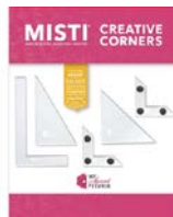
MISTI CREATIVE CORNERS Positioning...