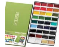
Zig Kuretake Gansai Tambi 36 COLOR SET