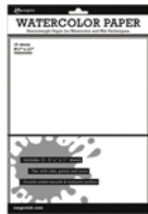
Ranger WATERCOLOR PAPER Inkssentials...