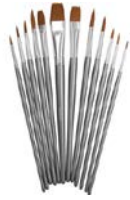
Tonic PAINT BRUSHES Nuvo 972n