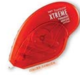
Tombow XTREME Permanent Adhesive Tape...