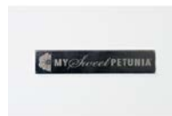
MISTI Neodymium BAR MAGNET 007070