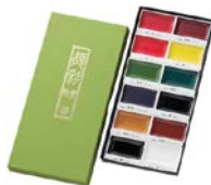
Zig Kuretake Gansai Tambi 12 COLOR SET