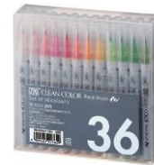
Zig CLEAN COLOR 36 SET Real Brush...