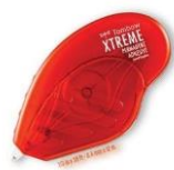
Tombow XTREME Permanent Adhesive Tape...