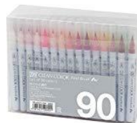
Kuretaker ZIG Clean Color