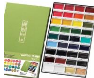
Zig Kuretaker Gansai Tambi 36 COLOR SET