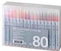
Kuretaker ZIG Clean Color