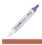
Copic Sketch Marker E17 REDDISH BRASS...