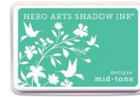
Hero Arts Shadow Ink Pad ANTIGUA AF373