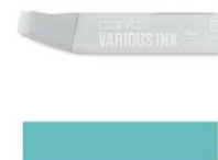
Copic Marker REFILL BG57 JASPER...