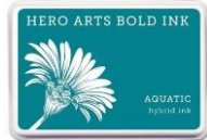
Hero Arts Hybrid Ink Pad AQUATIC AF339