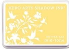
Hero Arts Shadow Ink Pad BUTTER BAR...