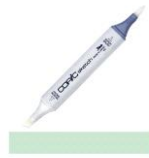
Copic Sketch MARKER G21 LIME GREEN