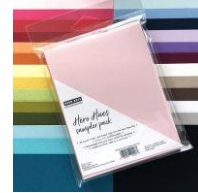
PS326 Hero Hues Cardstock Sampler...