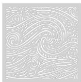
Hero Arts Stencil STARRY NIGHT SA126