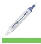
Copic Sketch Marker YG17 GRASS GREEN...