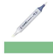
Copic Sketch Marker YG67 MOSS Dark Green