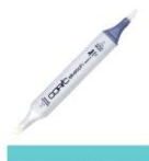
Copic Sketch Marker BG53 ICE MINT...