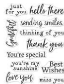
Hero Arts Clear Stamps SENDING SMILES...