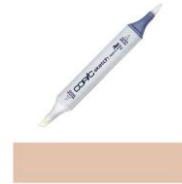
Copic Sketch Marker E13 LIGHT SUNTAN...