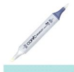
Copic Sketch Marker BG45 NILE BLUE