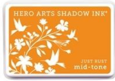
Hero Arts Shadow Ink Pad JUST RUST...