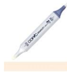
Copic Sketch MARKER E11 BARLEY BEIGE