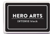
Hero Arts Ink Pad INTENSE BLACK AF345