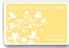
Hero Arts Shadow Ink Pad BUTTER BAR...