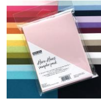
PS326 Hero Hues Cardstock Sampler...