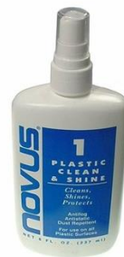
Novus PLASTIC CLEAN AND SHINE 1 MISTI...