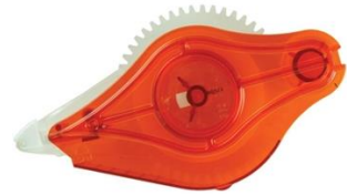
Tombow REFILL Xtreme Permanent...