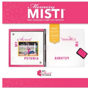
MISTI MEMORY MISTI PRECISION STAMPER...