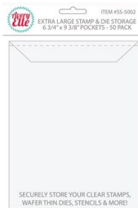
Avery Elle EXTRA LARGE Stamp and Die...