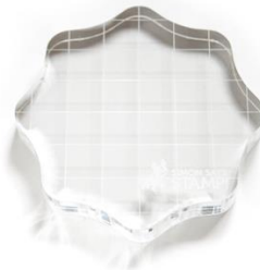
Simon Says Stamp 2.5 Inch ACRYLIC...