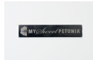
MISTI Neodymium BAR MAGNET 007070