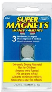
MISTI SUPER MAGNETS Disc mistism