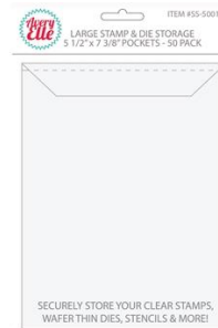
Avery Elle LARGE Stamp & Die Storage...