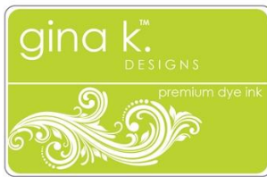
Gina K Designs KEY LIME Premium Dye...