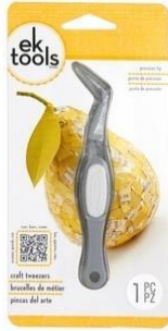
EK Success CRAFT TWEEZERS Precision...