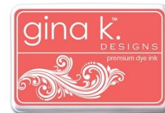
Gina K Designs DUSTY ROSE PREMIUM DYE...