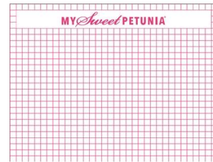
MISTI MOUSE PAD INSERT 000144