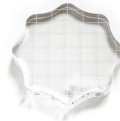
Simon Says Stamp 3.5 Inch ACRYLIC...