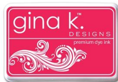
Gina K Designs PASSIONATE PINK...