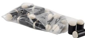
Tsukineko 25 SPONGE DAUBERS Tools...