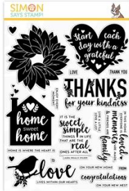
Simon Says Clear Stamps HOME SWEET...