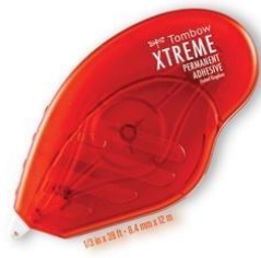
Tombow XTREME Permanent Adhesive Tape...