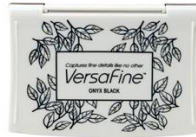
Tsukineko VersaFine ONYX BLACK Ink...