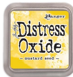
Tim Holtz Distress Oxide Ink Pad...