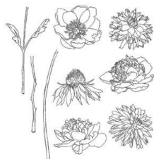
Tim Holtz Stamp - Cling - Flower Garden

Here are my Affiliate Links for the products I have used in today’s card share: