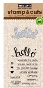
Hero Arts Stamp And Cuts HELLO...