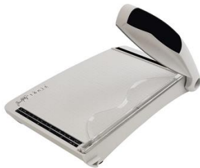
Tim Holtz Tonic GUILLOTINE COMFORT...