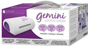
Crafter's Companion GEMINI JUNIOR...