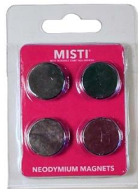
MISTI NEODYMIUM MAGNETS 4 Pack Discs...