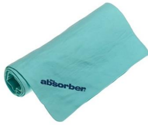
The AQUA Absorber Towel 17 x 27...