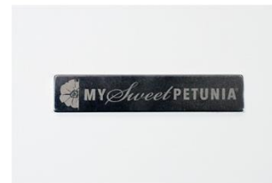
MISTI Neodymium BAR MAGNET 007070