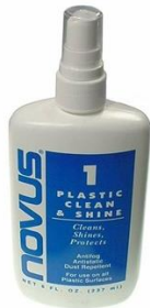
Novus PLASTIC CLEAN AND SHINE 1 MISTI...