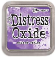
Tim Holtz Distress Oxide Ink Pad...