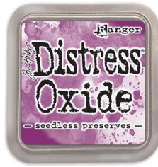
Tim Holtz Distress Oxide Ink Pad...