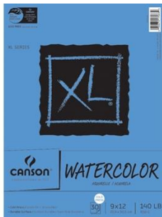
Canson XL WATERCOLOR PAPER 9x12 140lb...