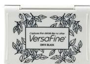
Tsukineko VersaFine ONYX BLACK Ink...