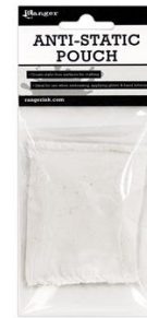
Ranger ANTI STATIC POUCH ink62332