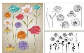
Tim Holtz - Dies - Flower Garden and...