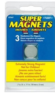
MISTI SUPER MAGNETS Disc mistism