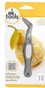
EK Success CRAFT TWEEZERS Precision...