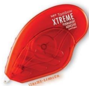
Tombow XTREME Permanent Adhesive Tape...