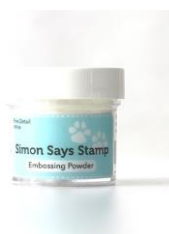
Simon Says Stamp EMBOSSING POWDER...