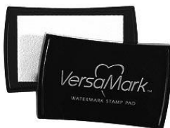
Tsukineko Versamark EMBOSS INK PAD...