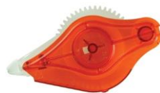
Tombow REFILL Xtreme Permanent...