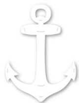
Simon Says Stamp ANCHOR Wafer Die...

7 – Attach the tag to the card front with foam tape.