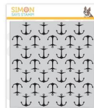
Simon Says Cling Stamp ANCHORS...