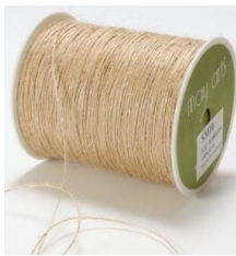
May Arts NATURAL Twine String Burlap