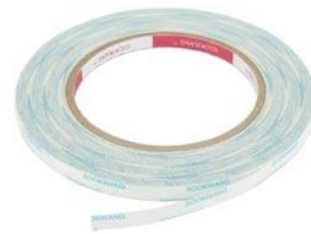
Scor-Tape 0.25 Inch Crafting Tape