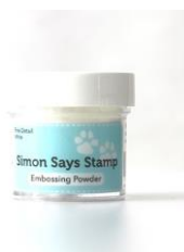
Simon Says Stamp EMBOSSING POWDER...