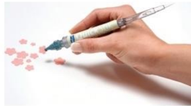
We R Memory Keepers QUICKSTIK...