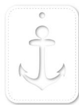
Simon Says Stamp ANCHOR TAG Wafer Die...