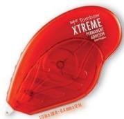
Tombow XTREME Permanent Adhesive Tape...