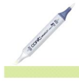
Copic Sketch MARKER YG13 CHARTREUSE...