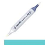
Copic Sketch Marker BG53 ICE MINT...