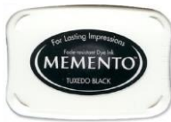
Memento - Ink Pad - Tuxedo Black