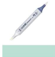
Copic Sketch Marker BG32 AQUA MINT