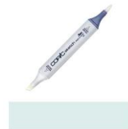
Copic Sketch Marker BG10 COOL SHADOW