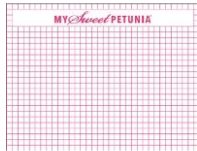
MISTI MOUSE PAD INSERT 000144