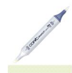
Copic Sketch Marker YG11 MIGNONETTE...