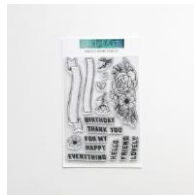
Concord and 9th - Clear Stamp -...