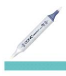
Copic Sketch Marker BG57 JASPER...