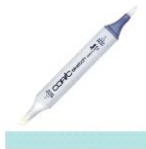
Copic Sketch Marker BG45 NILE BLUE