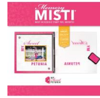
MISTI MEMORY MISTI PRECISION STAMPER...