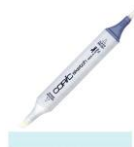
Copic Sketch Marker BG11 MOON WHITE