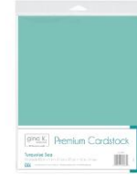
Therm O Web Gina K Designs TURQUOISE...