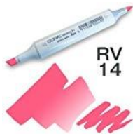
Copic Sketch Marker - RV14