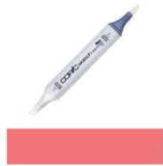
Copic Sketch Marker R24 PRAWN Red