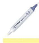
Copic Sketch Marker Y02 CANARY YELLOW...