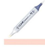
Copic Sketch MARKER R02 ROSE SALMON Pink