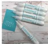
Gina K Designs CONNECT GLUE Adhesive...