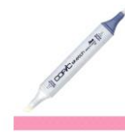
Copic Sketch Marker RV14 BEGONIA PINK...