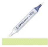
Copic Sketch MARKER YG13 CHARTREUSE...