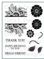
Clear Stamps- Bold and Blooming -...

Here are the supplies used. Where available I use Compensated Affiliate Links , which means if you make a purchase through my link, I receive a small commission at no extra cost to you. Thank you so very much for your support, I truly appreciate it.