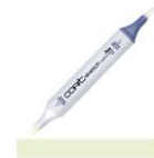
Copic Sketch Marker YG11 MIGNONETTE...