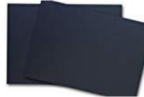
Classic Crest Epic Black 130 lb...