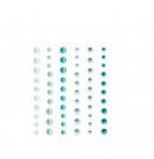
pool mixed accents