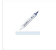
Copic Sketch Marker C1 COOL GRAY Grey