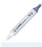
Copic Sketch MARKER C0 COOL GRAY NO. 0