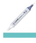
Copic Sketch Marker BG57 JASPER...