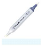
Copic Sketch Marker B00 FROST BLUE