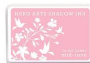
Hero Arts Shadow Ink Pad COTTON CANDY...