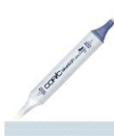
Copic Sketch MARKER C2 COOL GRAY NO. 2