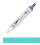
Copic Sketch Marker BG53 ICE MINT...