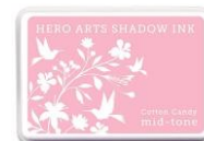
Hero Arts Shadow Ink Pad COTTON CANDY...