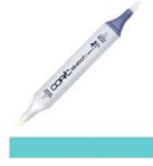
Copic Sketch Marker BG53 ICE MINT...