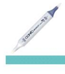
Copic Sketch Marker BG57 JASPER...