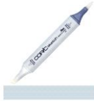
Copic Sketch MARKER C2 COOL GRAY NO. 2