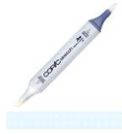
Copic Sketch Marker B00 FROST BLUE