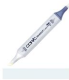
Copic Sketch MARKER C0 COOL GRAY NO. 0