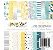
Honey Bee THE BEE'S KNEES 6 x 6 Paper...