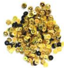
Simon Says Stamp Sequins BUZZY BEE...