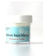
Simon Says Stamp EMBOSSING POWDER...