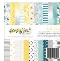
Honey Bee THE BEE'S KNEES 6 x 6 Paper...