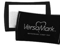
Tsukineko Versamark EMBOSS INK PAD...