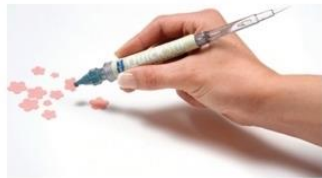
We R Memory Keepers QUICKSTIK...