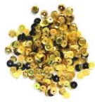
Simon Says Stamp Sequins BUZZY BEE...