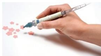
We R Memory Keepers QUICKSTIK...