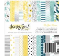
Honey Bee THE BEE'S KNEES 6 x 6 Paper...