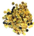
Simon Says Stamp Sequins BUZZY BEE...