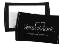
Tsukineko Versamark EMBOSS INK PAD...