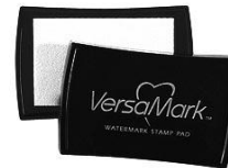
Tsukineko Versamark EMBOSS INK PAD...