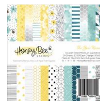
Honey Bee THE BEE'S KNEES 6 x 6 Paper...