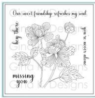
Clear Mini Stamps- Sweet Friendship -...

Here are the supplies used. Where available I use Compensated Affiliate Links, which means if you make a purchase through my link, I receive a small commission at no extra cost to you. Thank you so very much for your support, I truly appreciate it.