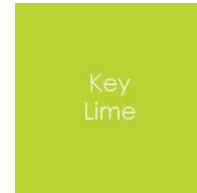
Gina K Designs - Cardstock - Key Lime