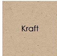
Gina K Designs - Cardstock - Kraft