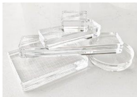
Gina K Designs - Comfort Block - 5...