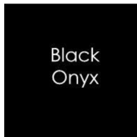
Gina K Designs - Cardstock - Black Onyx