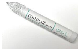
Gina K Designs - Adhesive - Connect Glue