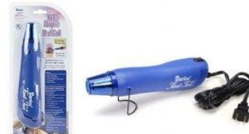
Darice - Heat Gun