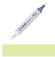
Copic Sketch Marker YG03 YELLOW GREEN