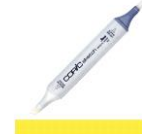
Copic Sketch Marker Y19 NAPOLI YELLOW...