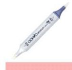
Copic Sketch Marker RV34 DARK PINK