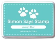
Simon Says Stamp Premium Dye Ink Pad...