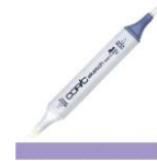
Copic Sketch Marker V17 AMETHYST...