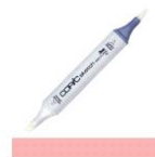
Copic Sketch Marker RV34 DARK PINK