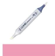
Copic Sketch Marker R83 ROSE MIST...