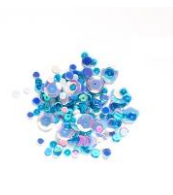
Simon Says Stamp Sequins RAINDROPS...