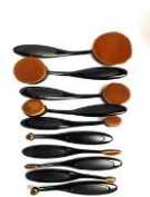
Picket Fence Studios LIFE CHANGING...