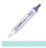
Copic Sketch Marker BG45 NILE BLUE