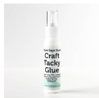
Simon Says Stamp CRAFT TACKY GLUE...