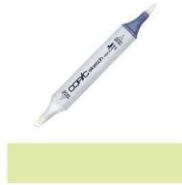
Copic Sketch Marker YG03 YELLOW GREEN