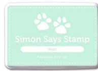
Simon Says Stamp Premium Dye Ink Pad...