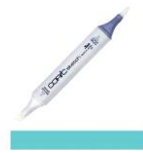
Copic Sketch Marker BG53 ICE MINT...