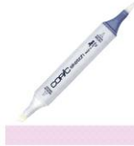
Copic Sketch Marker V12 PALE LILAC...