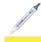
Copic Sketch Marker Y19 NAPOLI YELLOW...