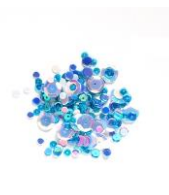
Simon Says Stamp Sequins RAINDROPS...