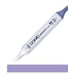
Copic Sketch Marker V17 AMETHYST...