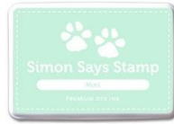
Simon Says Stamp Premium Dye Ink Pad...