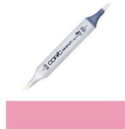
Copic Sketch Marker R83 ROSE MIST...