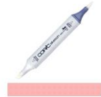
Copic Sketch Marker RV34 DARK PINK