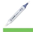
Copic Sketch Marker YG17 GRASS GREEN...