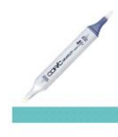
Copic Sketch Marker BG57 JASPER...