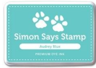
Simon Says Stamp Premium Dye Ink Pad...