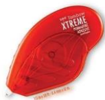
Tombow XTREME Permanent Adhesive Tape...