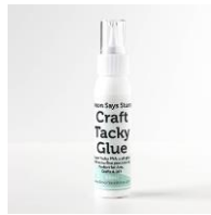
Simon Says Stamp CRAFT TACKY GLUE...