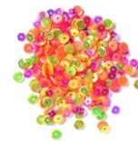
Simon Says Stamp Sequins CARIBBEAN...