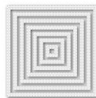
Simon Says Stamp STITCHED SQUARES...