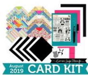
Simon Says Stamp Card Kit of The...

Here are the supplies used. Where available I use Compensated Affiliate Links , which means if you make a purchase through my link, I receive a small commission at no extra cost to you. Thank you so very much for your support, I truly appreciate it.