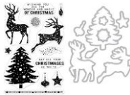
Hero Arts WONDER AND MAGIC OF...

Here are the supplies used. Where available I use Compensated Affiliate Links , which means if you make a purchase through my link, I receive a small commission at no extra cost to you. Thank you so very much for your support, I truly appreciate it.