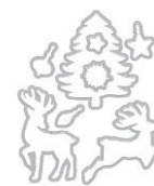
Hero Arts Frame Cuts Dies WONDER AND...