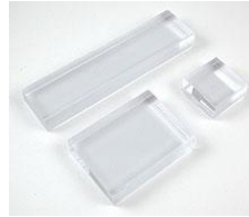
Hero Arts Rubber Stamp SMALL BLOCK...