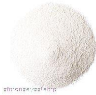
Hero Arts EMBOSS SPARKLE EMBOSSING...