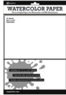
Ranger WATERCOLOR PAPER Inkssentials...