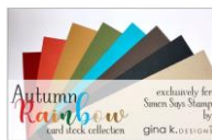
Gina K Designs AUTUMN RAINBOW 24 Pack...