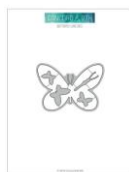
Butterfly Love dies