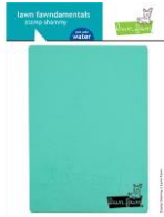
Lawn Fawn STAMP SHAMMY Cleaner LF1045