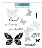
Butterfly Love Turnabout™

Here are the supplies used. Where available I use Compensated Affiliate Links, which means if you make a purchase through my link, I receive a small commission at no extra cost to you. Thank you so very much for your support, I truly appreciate it.