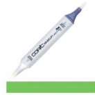
Copic Sketch Marker YG17 GRASS GREEN...