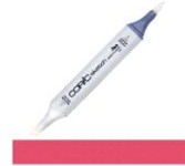
Copic Sketch Marker R46 STRONG RED...