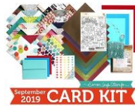
Simon Says Stamp Card Kit of The...

Here are the supplies used. Where available I use Compensated Affiliate Links, which means if you make a purchase through my link, I receive a small commission at no extra cost to you. Thank you so very much for your support, I truly appreciate it.