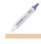
Copic Sketch Marker E35 CHAMOIS Light...