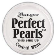
Ranger Perfect Pearls CONFETTI WHITE...