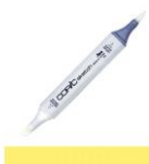
Copic Sketch MARKER Y15 CADMIUM YELLOW