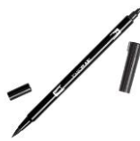
Tombow N15 BLACK Dual Brush Marker 56621