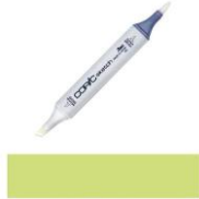
Copic Sketch Marker YG25 CELADON...