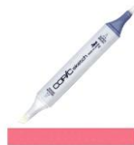
Copic Sketch Marker R35 CORAL