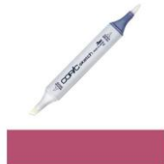
Copic Sketch Marker R59 CARDINAL...