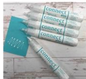
Gina K Designs CONNECT GLUE Adhesive...