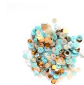
Simon Says Stamp Sequins SUNKEN...