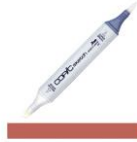
Copic Sketch Marker E17 REDDISH BRASS...