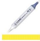
Copic Sketch Marker Y19 NAPOLI YELLOW...