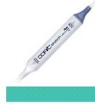
Copic Sketch MARKER BG18 TEAL BLUE