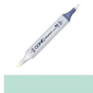
Copic Sketch Marker BG32 AQUA MINT