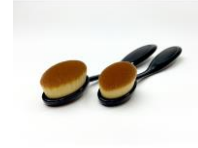
Picket Fence Studios LIFE CHANGING...