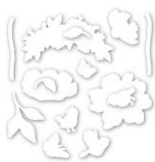
Simon Says Stamp LOOK FOR THE...