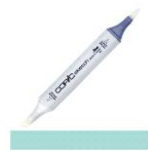
Copic Sketch Marker BG15 AQUA Blue